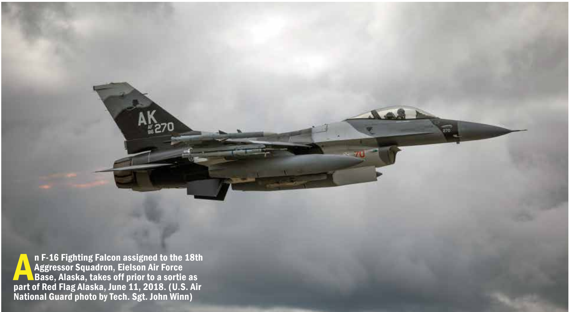
A n F-16 Fighting Falcon assigned to the 18th Aggressor Squadron, Eielson Air Force Base, Alaska, takes off prior to a sortie as part of Red Flag Alaska, June 11, 2018.