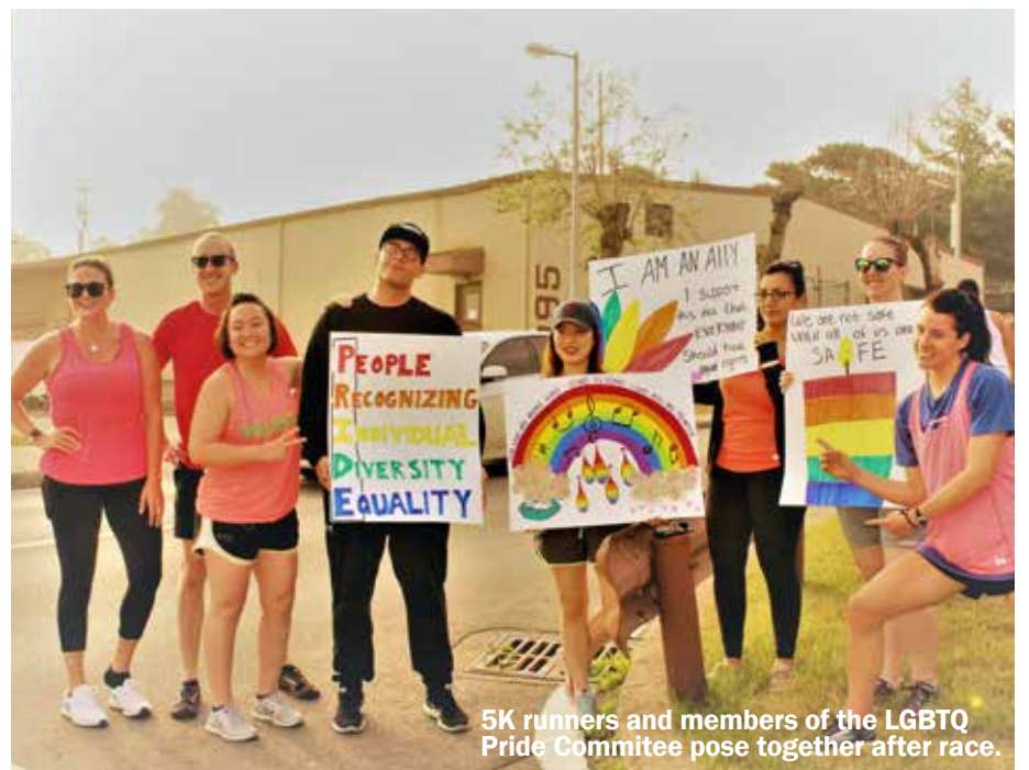
5K runners and members of the LGBTQ Pride Committee pose together after race.