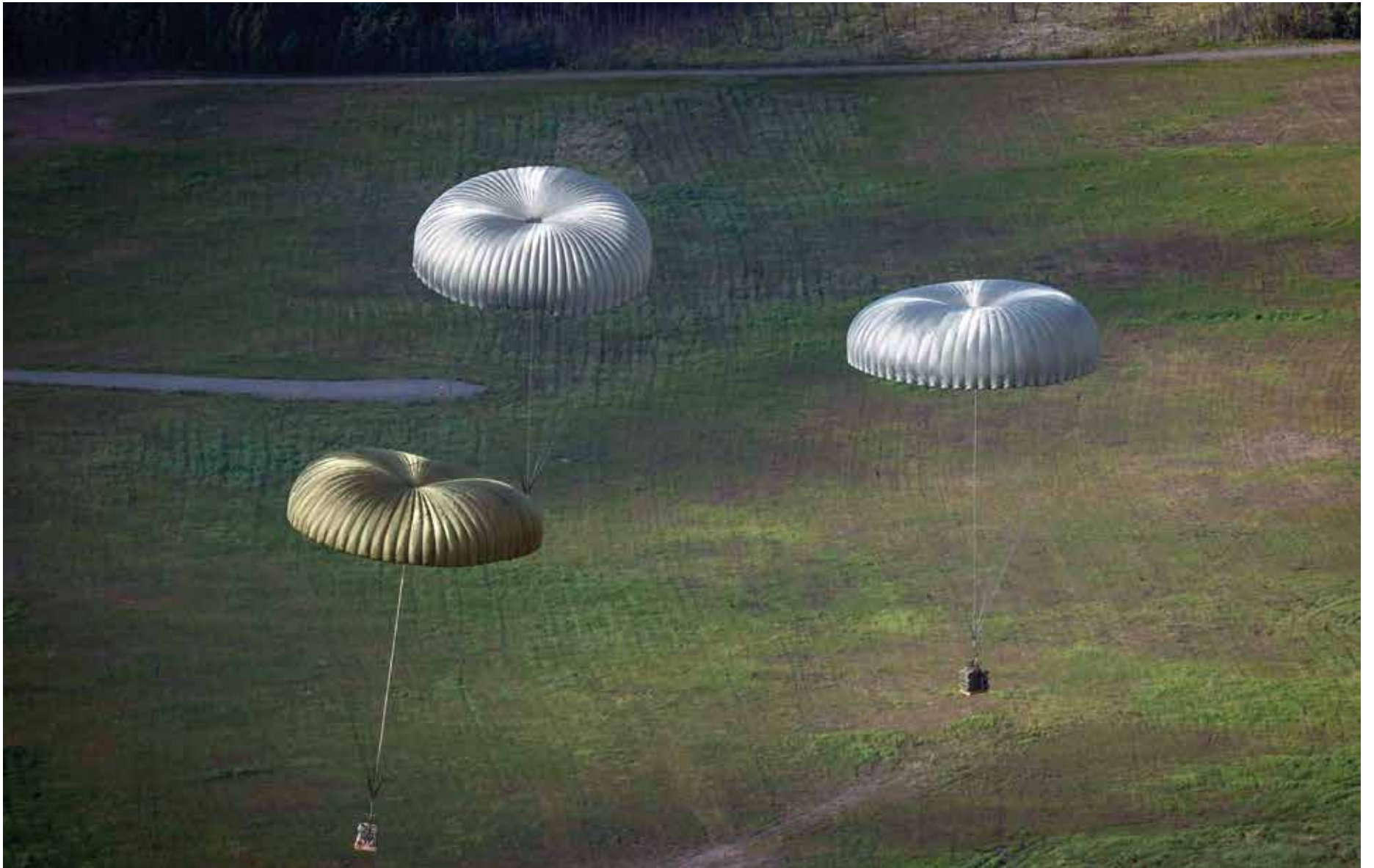
Containment delivery system bundles parachute to the ground after being dropped from a C-130J Super Hercules assigned to the 36th Airlift Squadron during Red Flag-Alaska, June 15, 2018, near Joint Base Elmendorf-Richardson, Alaska. Approximately 2,000 total service members participate in the exercise each year, with about 1,300 coming from outside Alaska-including more than 200 international visitors (U.S. Air Force photo by Airman First Class Juan Torres).

By Airman First Class Juan Torres, 374th Airlift Wing