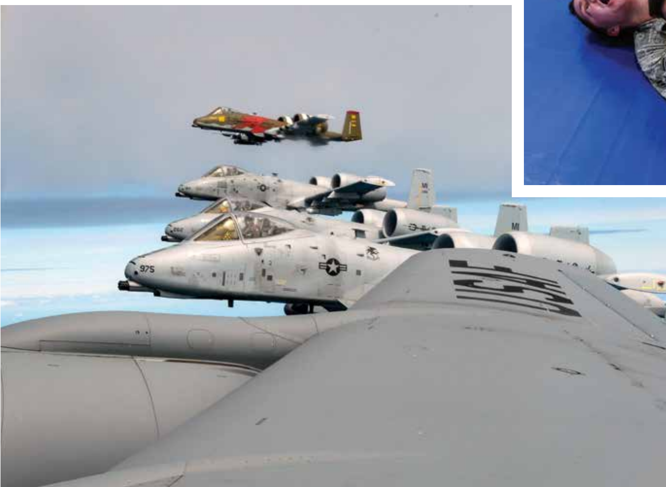
F our A-10 Thunderbolt II aircraft fly next to a KC-135 Stratotanker during Saber Strike 18, June 8, 2018. All four A-10s were refueled in flight allowing them to quickly return to their training and provide support for the exercise. ◀