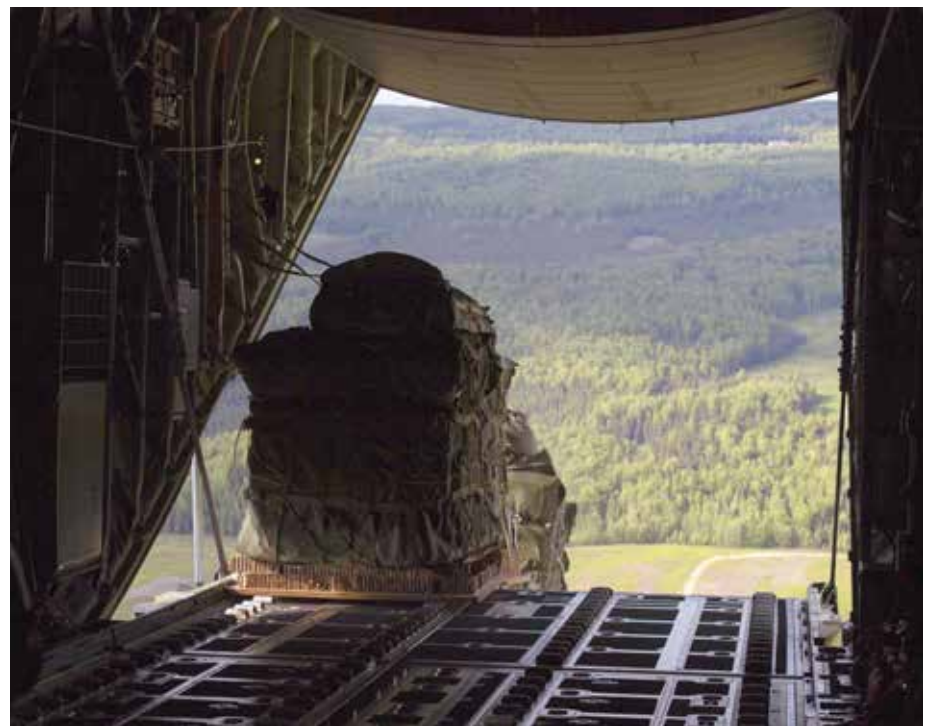
Containment delivery system bundles fall out the back of a C-130J Super Hercules assigned to the 36th Airlift Squadron during Red Flag-Alaska, June 15, 2018, near Joint Base Elmendorf-Richardson, Alaska. RF-A is a Pacific Air Forces-directed field training exercise for U.S. and international forces flown under simulated air combat conditions.