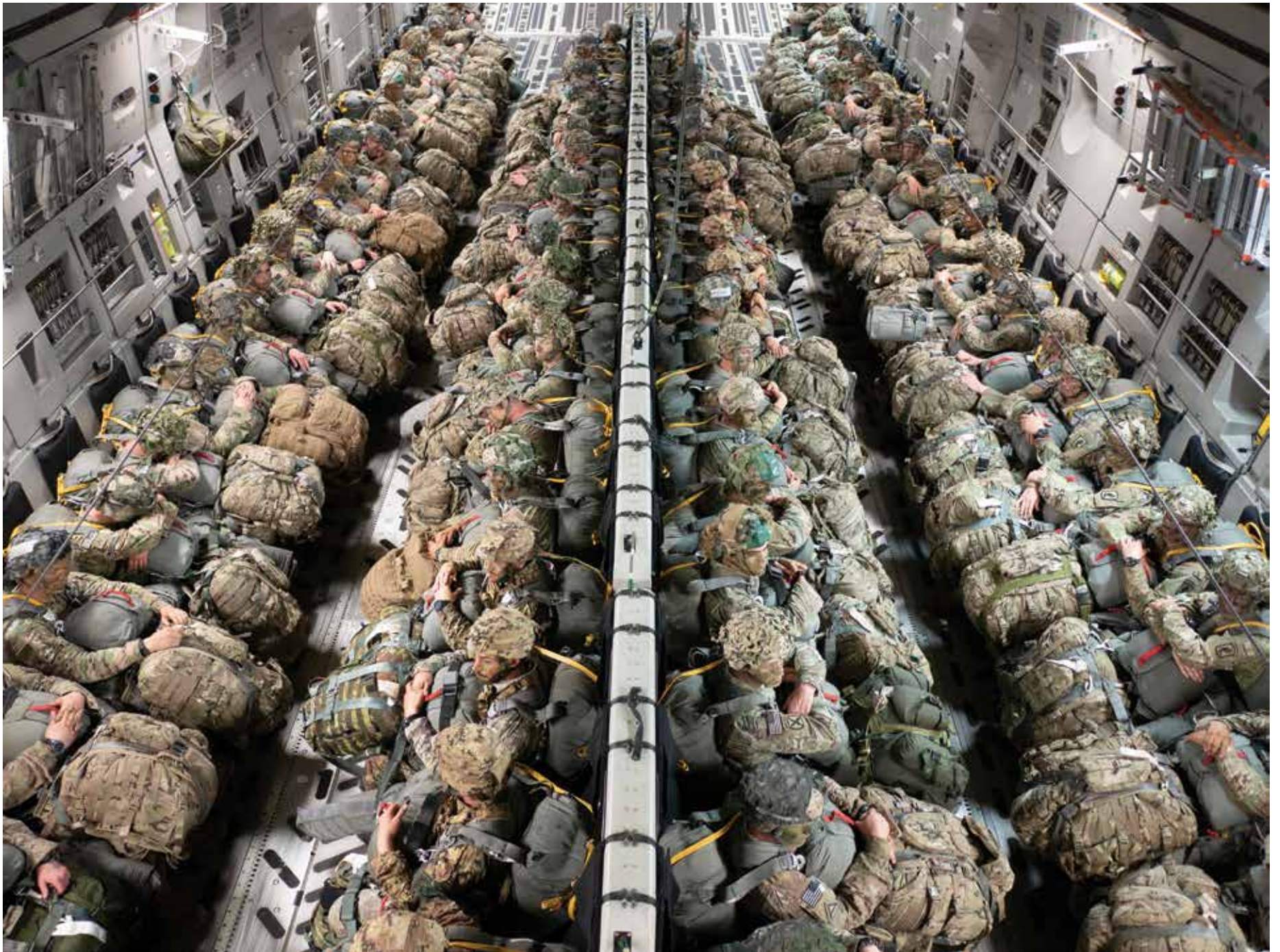
M embers of the Army's 1st Battalion, 503rd Infantry Regiment, 173rd Airborne Brigade and the Italian Army's 186th Airborne Regiment, Forlgoe Brigade board a C-17 Globemaster III during exercise Bayonet Strike June 13, 2018, at Aviano Air Base, Italy. ▲