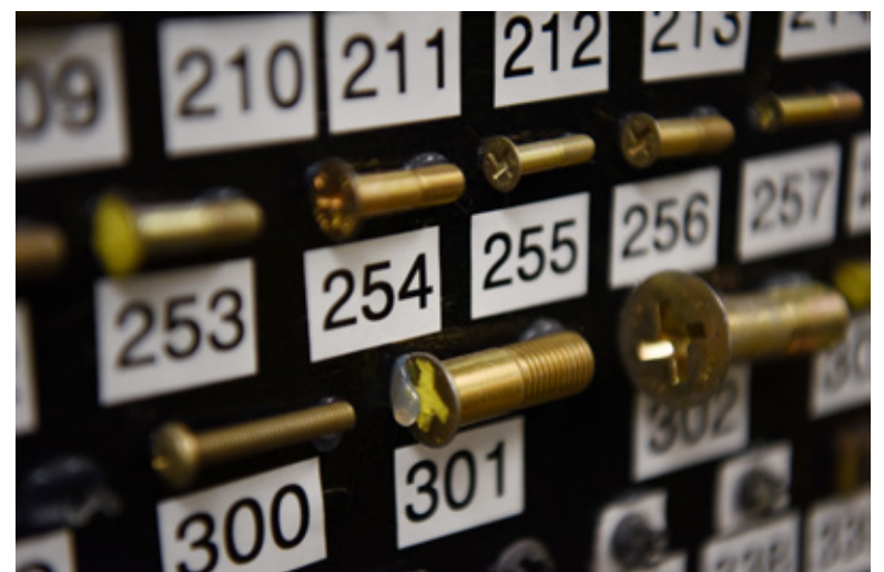
Beginning in September 2018, the 80th Aircraft Maintenance Unit supply section started creating innovative ways to streamline the ease of tool checkout for maintainers at Kunsan Air Base, Republic of Korea. The shadow board has numbered items that correspond with the items bin location. ▲