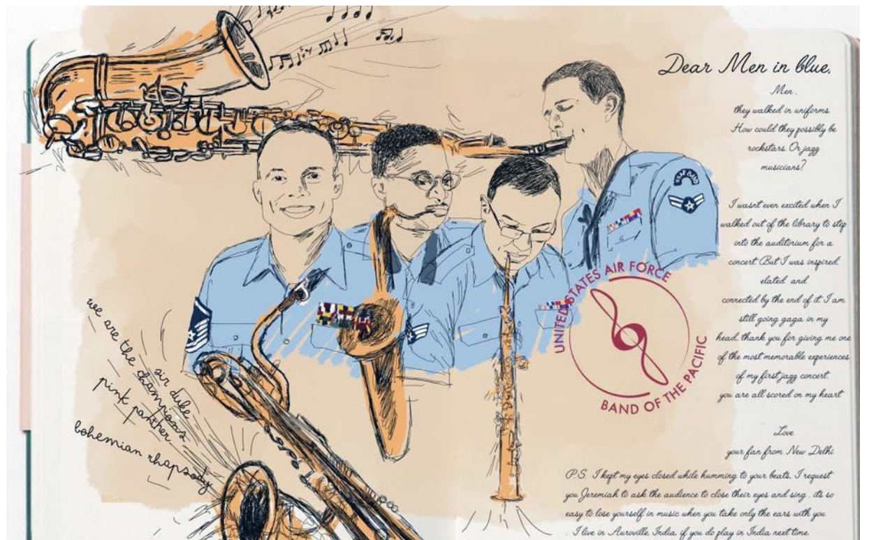
U.S. Air Force Band of the Pacific members received a piece of artwork after one of their performances.