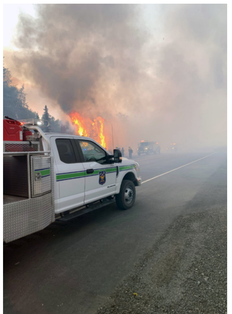
Joint Base Elmendorf-Richardson firefighters engage in fire suppression efforts on the McKinley Fire near mile marker 90.5 along the Parks Highway in Alaska, Aug. 18, 2019. The Matanuska-Susitna area fire management officer requested assistance from the JBER taskforce, which immediately responded and fought the fire alongside local and state firefighters.

For information on safe fire practices, visit the JBER Fire Prevention website at https://www.jber.jb.mil/Services-Resources/Fire-Prevention/ . For emergencies, call 911.