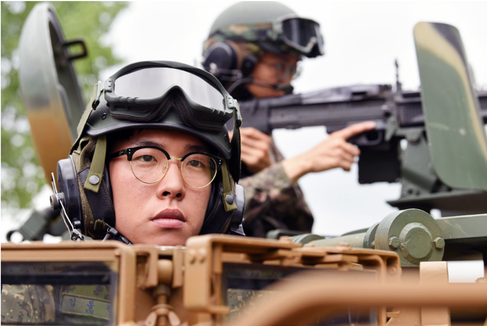
Republic of Korea military police force members provide over-watch during hostile response force training July 25, 2019, at Gwangju Air Base, Republic of Korea. During Pacific Defender Outreach 19-1 joint forces shared force protection tactics, techniques, and procedures while developing and enhancing interpersonal relationships. ▲

Members attended classroom sessions followed by practical applications revolving around base defense, team tactics, casualty care, perimeter defense, combatives and flight line security.