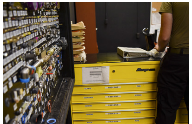
An Airman from the 80th Aircraft Maintenance Unit locates maintenance parts after referencing the new shadow board at Kunsan Air Base, Republic of Korea, Aug. 16, 2019. The 80th AMU supply section provides tool checkout services and parts for aircraft and equipment maintenance to more than 200 maintainers each day. ▲

While many of the innovations were formulated and accomplished by the 80th AMU support section Airmen, various other base agencies also helped transform the shop including the 8th Civil Engineer Squadron and the 8th Logistics Readiness Squadron.