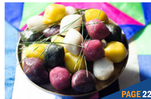
Traditional Korean Holiday of Bountiful Harvest, Chuseok