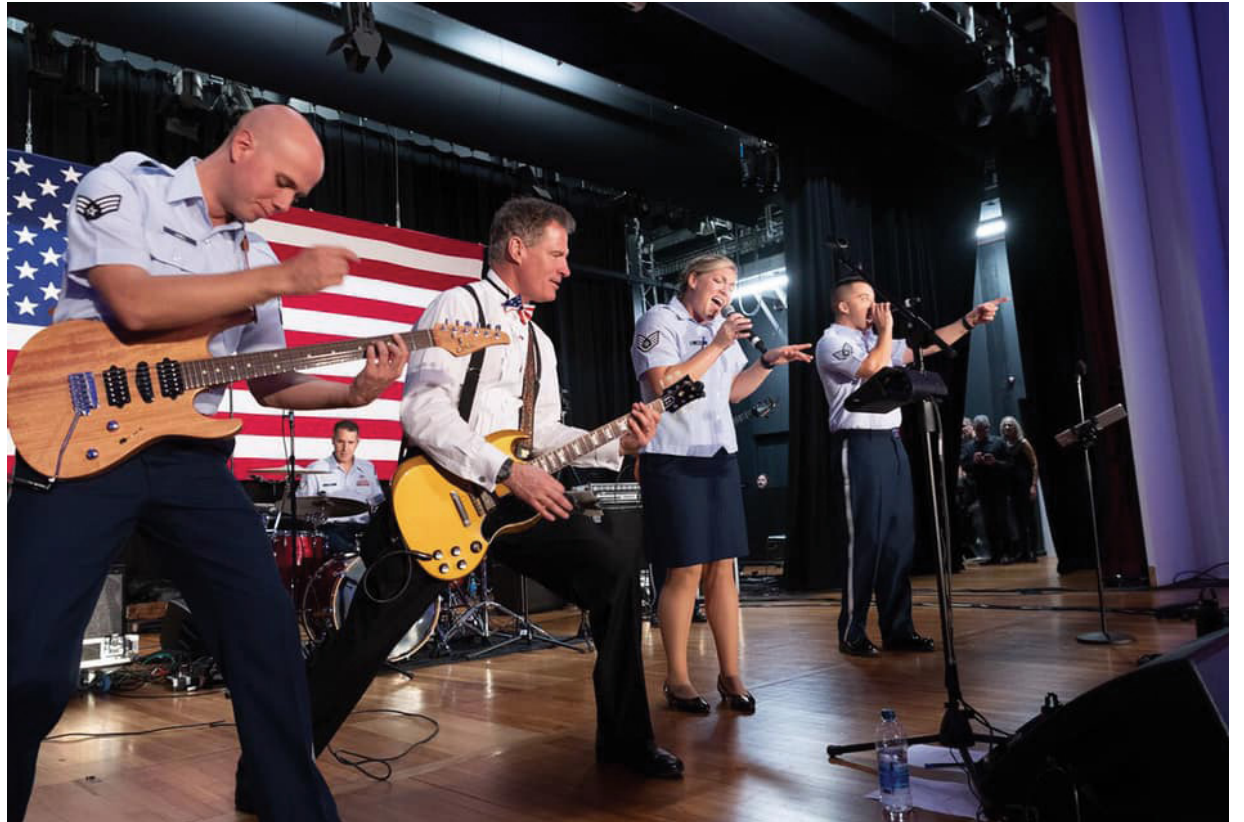
U.S. Air Force Band of the Pacific members from Small Kine perform in New Zealand during a recent event.

Here in the Indo-Pacific, 40 Airmen make up the U.S. Air Force Band of the Pacific, responsible for an area of operations that spans across 36 nations. They provide musical services for a range of events in the Department of Defense’s largest, and prioritized, area of responsibility. From international airshows, music festivals, schools, to cultural festivals and military functions, they are known to play popular and traditional songs at each location to enhance understanding of military operations