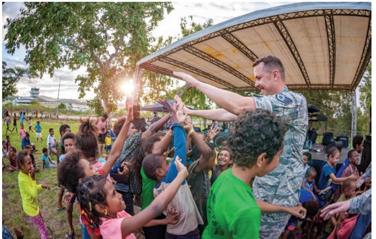
U.S. Air Force Band of the Pacific members take photos with fans after their performance.