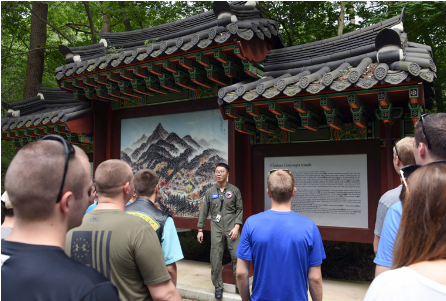
Members of the 25th Fighter Squadron at Osan Air Base, Republic of Korea, visit the Chiaksan Guryongsa temple during a during a “friendship day” visit with their ROK Air Force counterparts August 21, 2019. This “friendship day” allowed the U.S. and ROKAF military members the opportunity to integrate and strengthen their relationships. ▲