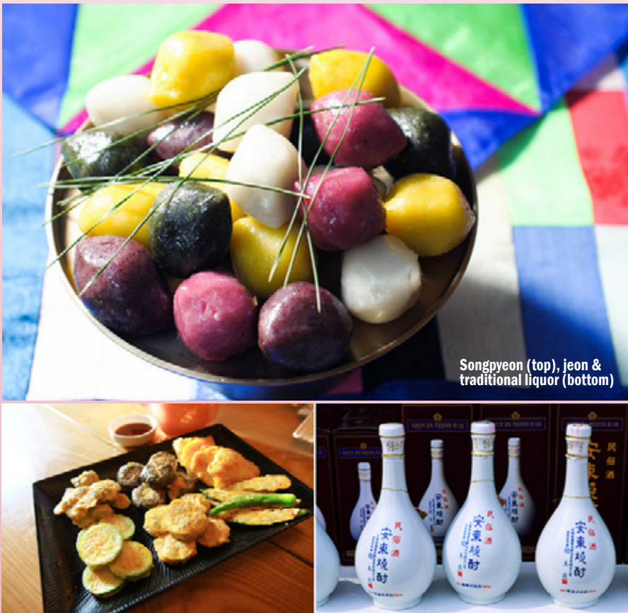
Songpyeon (top), jeon & traditional liquor (bottom)

Sponsored by the Gyeonggi provincial Government