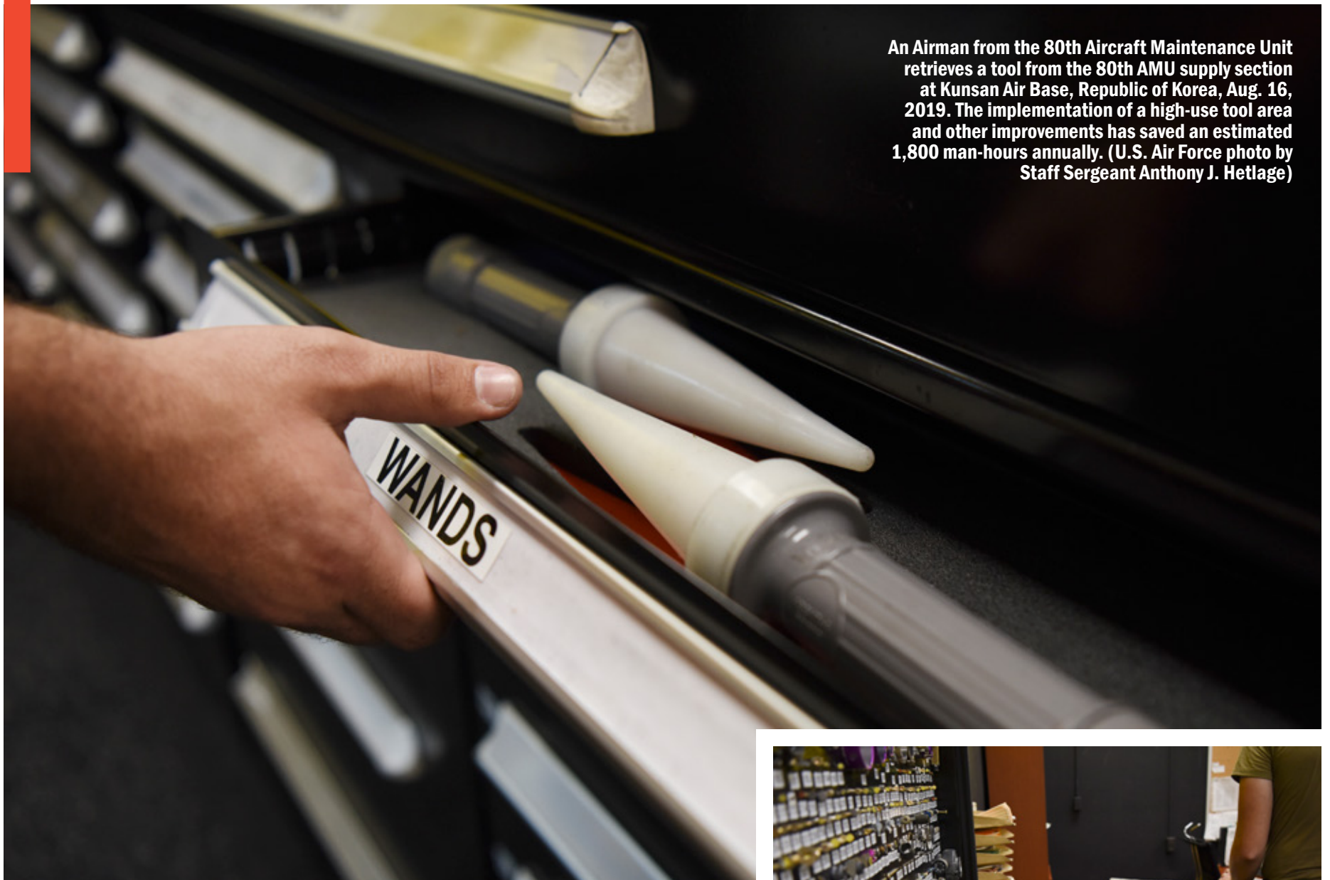
An Airman from the 80th Aircraft Maintenance Unit retrieves a tool from the 80th AMU supply section at Kunsan Air Base, Republic of Korea, Aug. 16, 2019. The implementation of a high-use tool area and other improvements has saved an estimated 1,800 man-hours annually.

By Staff Sgt. Anthony Hetlage 8th Fighter Wing Public Affairs