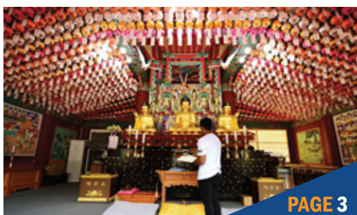
USAF, ROKAF pilots bond with Friendship Day