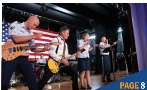
"Dear men in blue..."