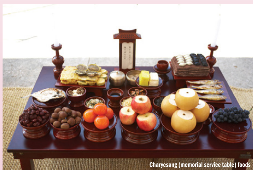
Charyesang (memorial service table) foods